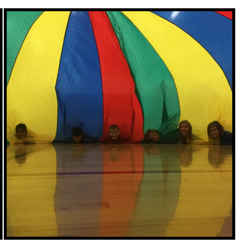
Mrs. Powers 2nd grade class having fun INSIDE the parachute.

This quarter we learned about our classroom procedures, began & finished our Catch 22 Unit where we learned the fundamentals of throwing over and under hand and catching high and low. We finished off the quarter with a fun day with the parachute and a Student Choice day where students were able to pick a supporting activity from any lesson taught during the first quarter.