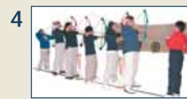
4 Each step of the shooting sequence is triggered by a command from the instructor.