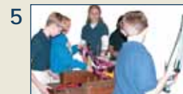
5 When each archer has shot their arrows and the range is clear, three whistles allow the archers to set their equipment aside.