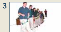
3 One whistle is blown to indicate that shooting can begin in a sequence of steps.