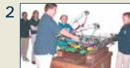
2 Proceed upon hearing two whistles to the shooting line.