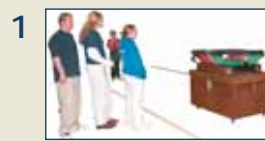
1 Start at the waiting line.